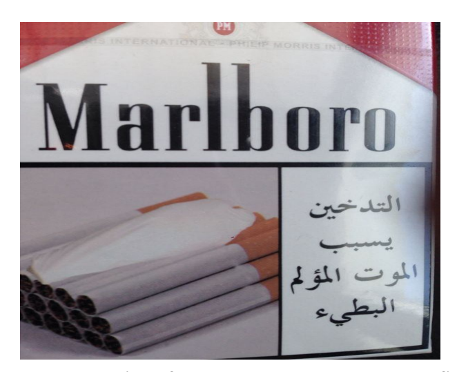
Figure 1.Pictorial Health Warning of an Enshrouded Person over a Stack of Cigarettes

The study is structured as follows. Section 2 provides a review on pictorial health warning and smoking changes literature is undertaken. Section 3 presents the research methodology. In Section 4, findings and discussions are provided, highlighting the conceptual framework for the effect of health advertising on smoking changes. The last section includes conclusions and clarifies contributions made by this study in addition to the authors' recommendations.